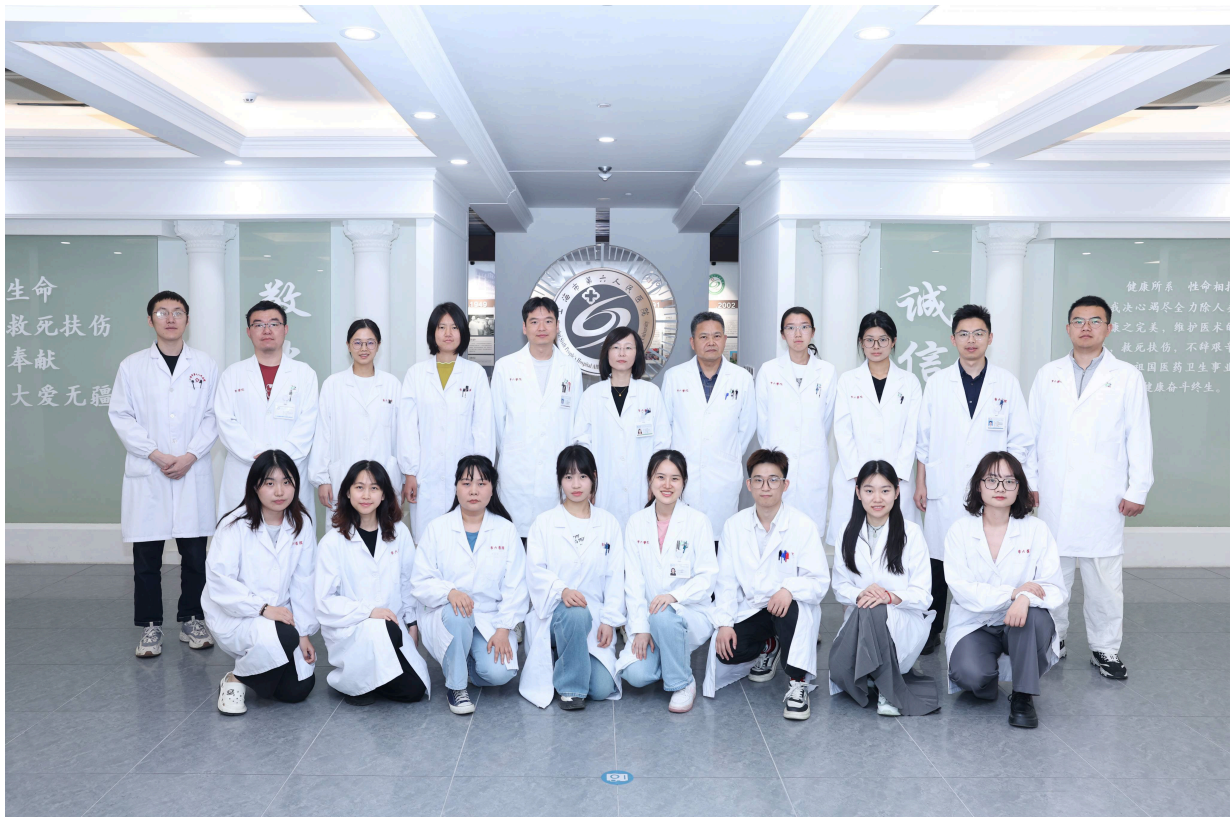
ENT tinnitus study team at The Sixth People's Hospital, Shanghai Jiao Tong University