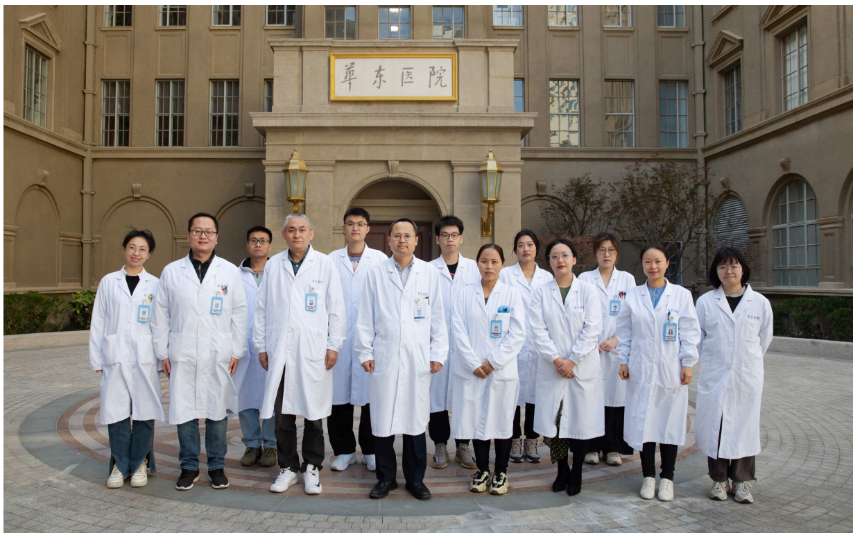
ENT team at Huadong Hospital, Fudan University